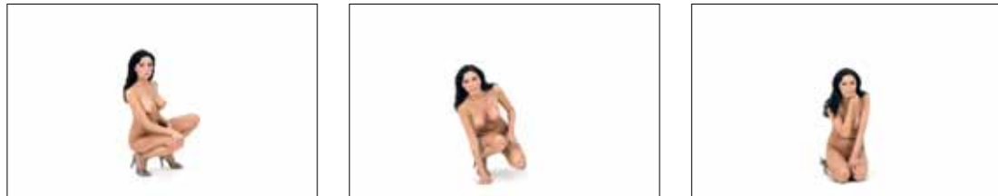
Benjamin Füglistner, Untitled, 2008. From Penetration 1. Inkjet Print, 30 x 52.5 cm each