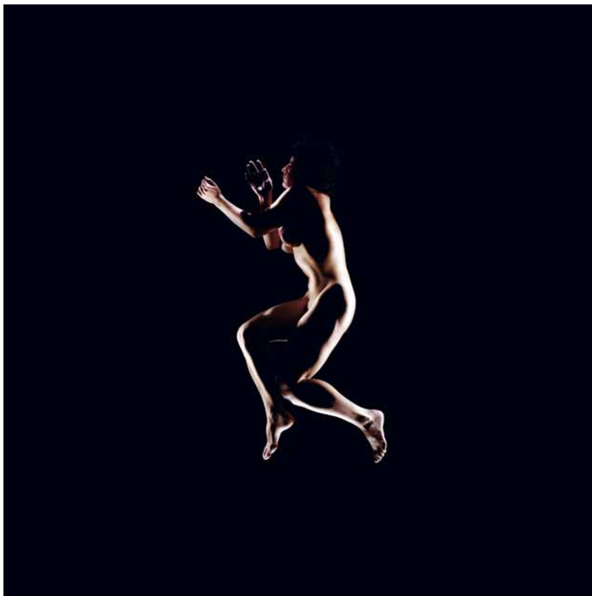
Untitled, from »Body/Mind«, 2006. Inkjetprint, 36 x 36 cm