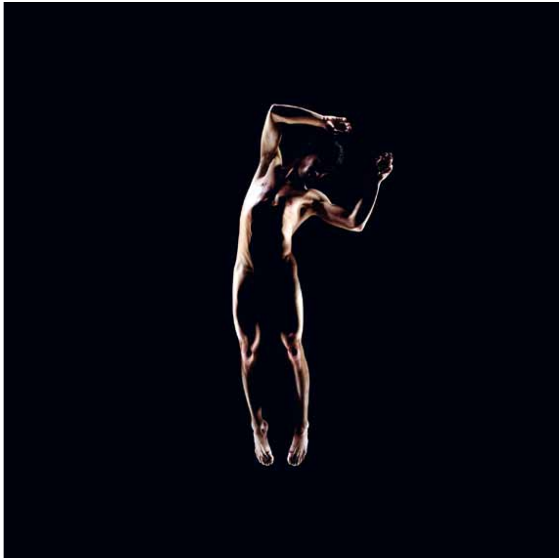
Untitled, from »Body/Mind«, 2006. Inkjetprint, 36 x 36 cm