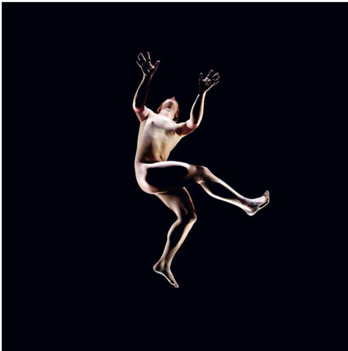
Untitled, from »Body/Mind«, 2006. Inkjetprint, 36 x 36 cm