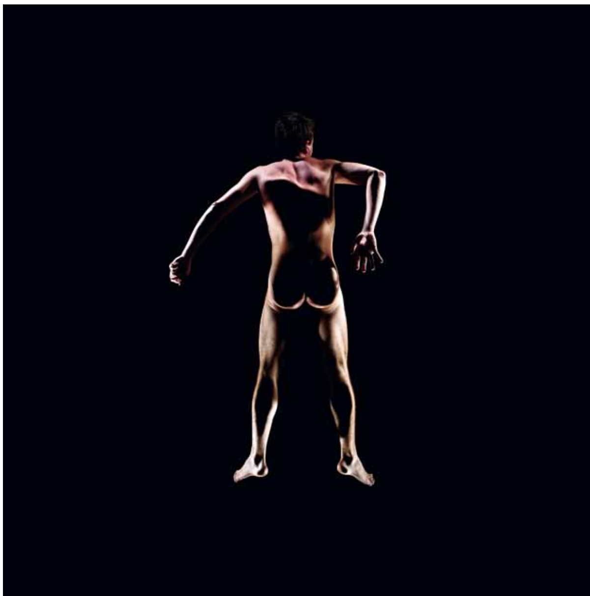
Untitled, from »Body/Mind«, 2006. Inkjetprint, 36 x 36 cm