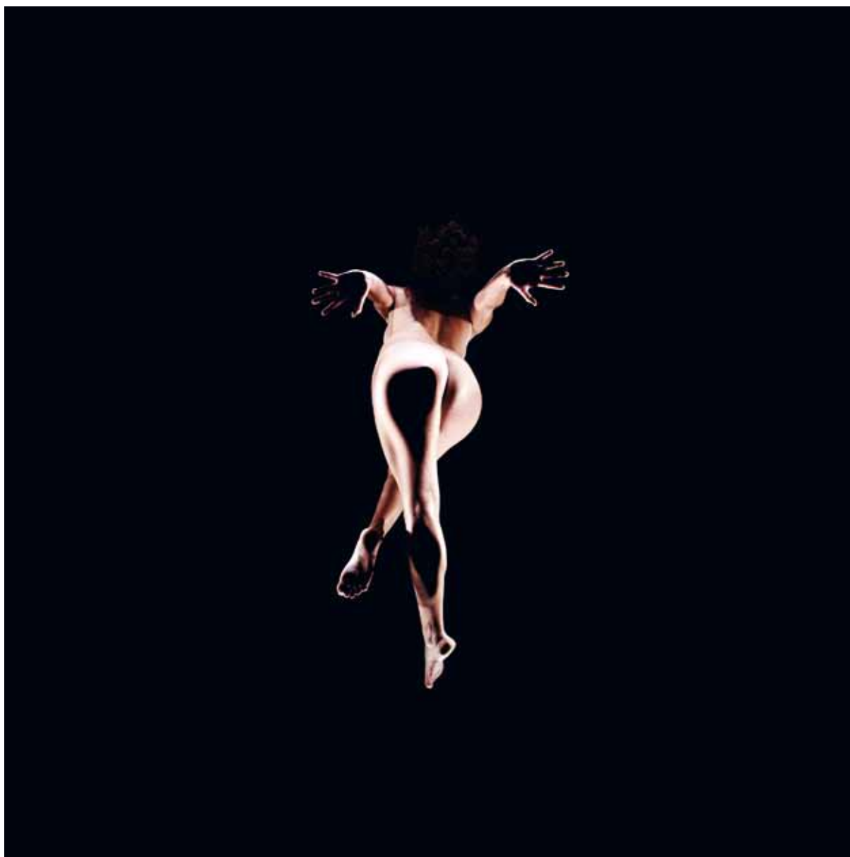
Untitled, from »Body/Mind«, 2006. Inkjetprint, 36 x 36 cm