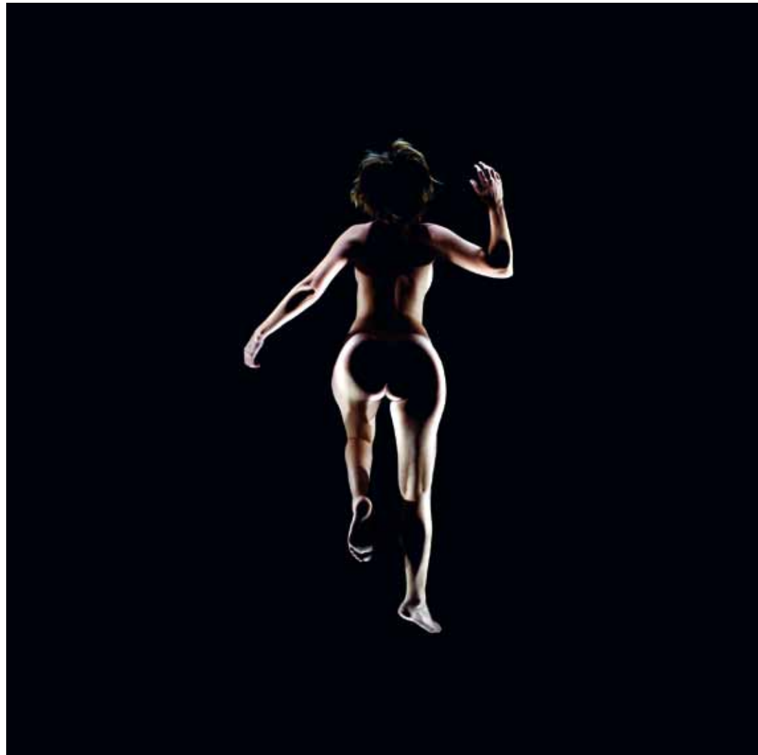
Untitled, from »Body/Mind«, 2006. Inkjetprint, 36 x 36 cm