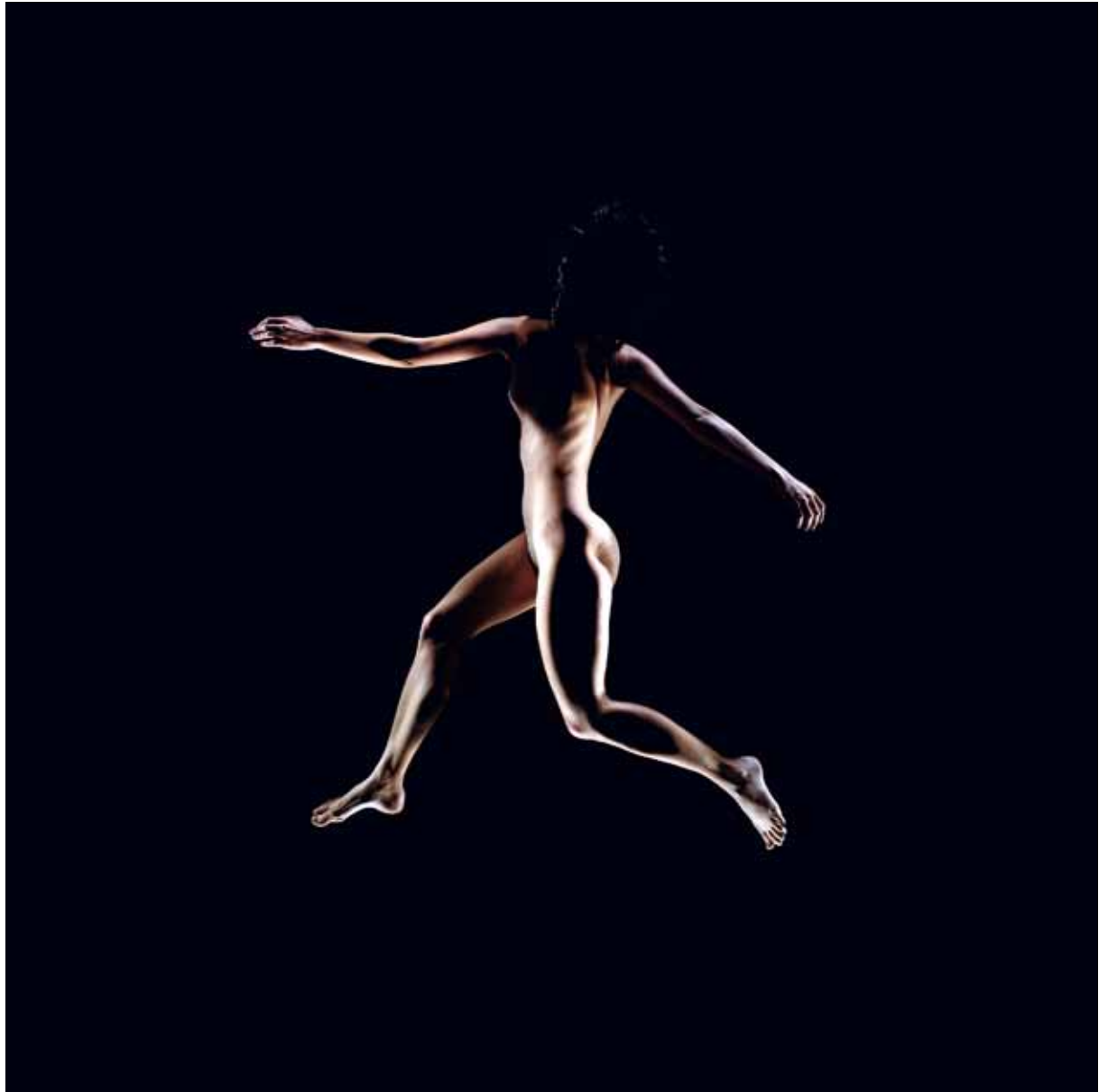
Untitled, from »Body/Mind«, 2006. Inkjetprint, 36 x 36 cm